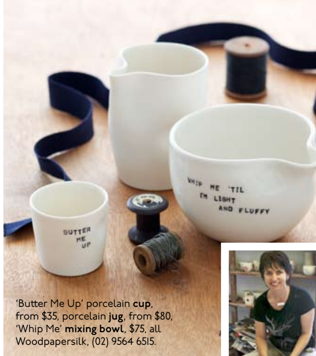
'Butter Me Up' porcelain cup, from $35, porcelain jug, from $80, 'Whip Me' mixing bowl, $75, all Woodpapersilk, (02) 9564 6515.